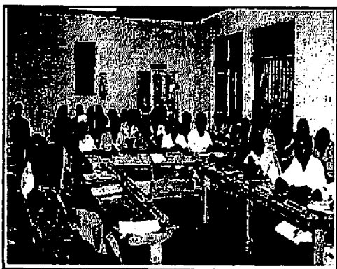
Participants at a national training workshop for CODEO observers held in Kumasi.

The training programs began with a 3-day "training-of-trainers" national workshop for fifty (50) participants in Kumasi on 29 September 2000. Member organizations of CODEO nominated five (5) participants from each of the ten regions in the country. At the end of the training workshop, the trainers were tasked to organize regional training workshops in all the regions.